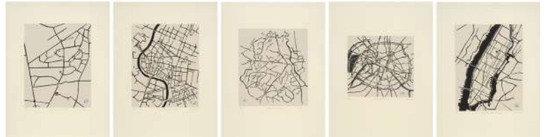
(above) Cities I called home , serie Portfolio of 5 prints : Aligarh, Bangkok, Delhi, Paris, New York, 2010, Woodblocks engraved in black on handmade Nepalese paper mounted on cream Arches paper, 66 x 50,8 cm (chaque)