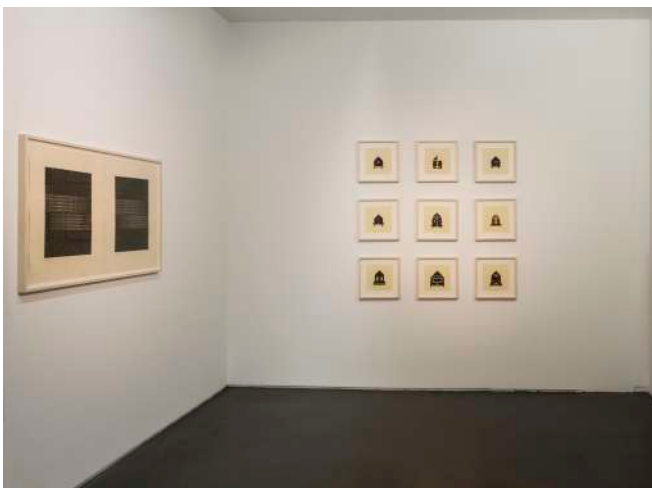
Solo exhibition Life lines, 2016, Jeanne Bucher Jaeger, Paris, Marais

Primarily working in intaglio, woodblock, lithography, and silkscreen, Zarina always made her life the subject of her art. She was one of those rare women artists of her generation to have forged a real identity with her etchings and sculptures on the subject of partition, exile and the longing for home. Her works, made mostly out of paper, engraved, woven, pierced and sculpted, are like musical scores on continuous memory, initiated in her cultivated background, where her father taught history, and literature and poetry played an important role in developing her mind. Her love of books and reading continued throughout her life, to such an extent that she defined paper as a second skin, one that could breathe, age, be stained, hurt, or moulded; as did her attachment to words, which preceded images, and to her mother-tongue, Urdu, which she integrated endlessly in her work. Her studies of mathematics and her fascination for the pure geometry of Mughal architecture, with its perfect symmetry and balance, were determining factors in the development of her art, which took the form of an initiatory and mystical journey.