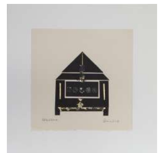
Folded House , 2016 Collage of 22-carat gold leaf and BFK light paper printed with black ink mounted on Arches paper, 22,8 x 22,8 cm, framed : 34,01 x 34,01 cm © Jean-Louis Losi, Courtesy Jeanne Bucher Jaeger, Paris-Lisbon