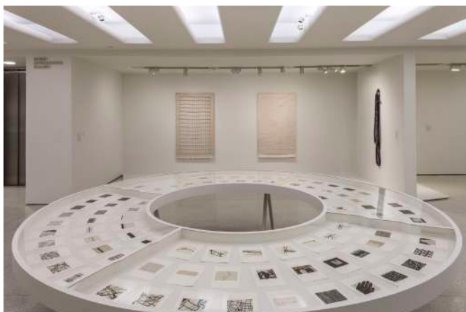
Solo exhibition Zarina: Paper Like Skin, 2013, Guggenheim, New York

An emblematic figure in South Asia, Zarina's work has been exhibited by the most important institutions and supported by the Jeanne Bucher Jaeger Gallery since 2008 through solo and group exhibitions and loans to major international museums. She was one of the four artists representing the Indian Pavilion at the 54th Venice Biennale in 2011. In 2012-2013, the Hammer Museum in Los Angeles, then the Guggenheim in New York and the Art Institute of Chicago presented her retrospective Zarina: Paper Like Skin . Her work has joined the collections of the Hammer Museum, the San Francisco Museum of Modern Art, the Whitney Museum of American Art, the MET and MoMA in New York, the Menil Collection in Houston, the Victoria and Albert Museum and the Tate Modern in London, the Bibliothèque Nationale and the Centre Pompidou in Paris, the LaM in Villeneuve d'Ascq... In 2016, the gallery presented the exhibition Life Lines , her last before she passed away in 2020. Her work remains a sensitive, intimate and transcendent testimony of her life. She said of memory that "it is the only possession we have that remains through time." Her last works depict the cosmos in gold leaf with a feeling of serenity, as if her final journey were taking her to a universal home.