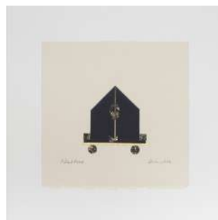
Folded House , 2016 Collage of 22-carat gold leaf and BFK light paper printed with black ink mounted on Arches paper, 22,8 x 22,8 cm, framed : 34,01 x 34,01 cm © Jean-Louis Losi, Courtesy Jeanne Bucher Jaeger, Paris-Lisbon