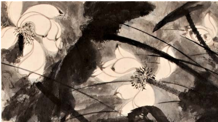
Chang Dai-chien (Zhang Daqian) (1899-1983) Lotus in the wind, dated 1955 Ink and colors on paper 184.4 × 96.2 cm M.C. 8768 Donated by the artist, 1956

Key artists: Pang Xunqin, Wu Zuoren, Xu Beihong, Lin Fengmian