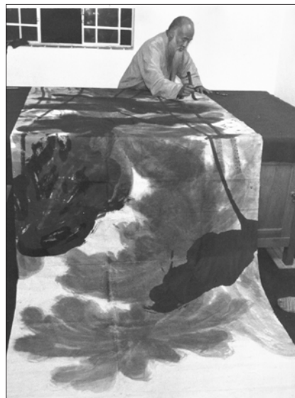
Chang Dai-chien (Zhang Daqian) drawing the lotus leaves of the penultimate left-hand panel ( Giant Lotus , 1961)