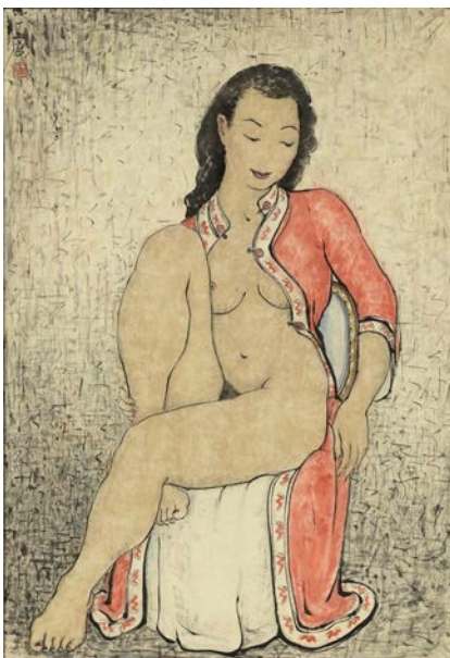
Pan Yuliang (1894-1977) Seated nude with red robe, 1955 Ink and colors on paper 91.6 × 64.8 cm M.C. 9699 Donated by the Embassy of the People's Republic of China in France, 1981