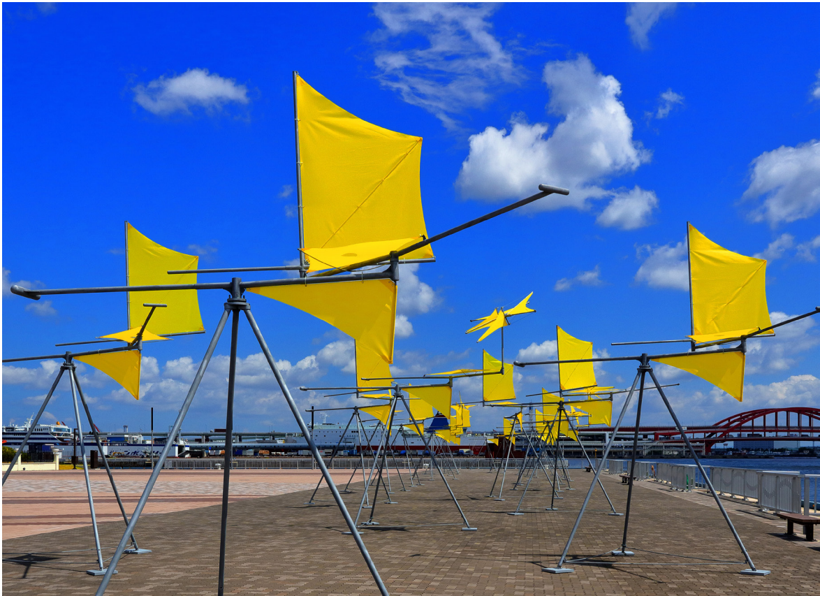
Susumu Shingu, Wind Caravan Kobe , 2017