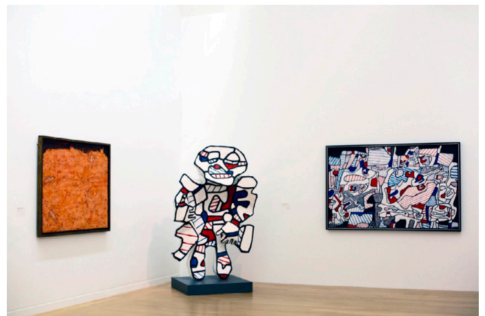
Exhibition Passion de l'Art - Galerie Jeanne Bucher Jaeger since 1925 , Musée Granet, Aix-en-Provence, 2017