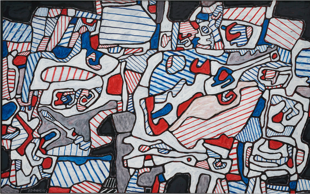
Site domestique (au fusil espadon) avec tête d'Inca et petit fauteuil à droite, January 28, 1996 Vinyl on canvas, 125 x 200 cm © Jean-Louis Losi, Courtesy Jeanne Bucher Jaeger, Paris-Lisbon

In 2022, the gallery devotes its twentieth exhibition, Le Cours des choses , to Jean Dubuffet, dedicated to Jean-François Jaeger. Conceived as a “ biographie au pas de course ” (“speedy biography”) retracing the works by Dubuffet shown at the gallery starting in 1964, the exhibition presents paintings, sculptures and works on paper from various cycles from the 1950s until his death in 1985 : the extensive Hourloupe cycle (1962-1974) promoted worldwide and exclusively between the gallery and the Swiss dealer Ernst Beyeler for more than a decade, his Psycho-sites , the series Mires Boléro and Kowloon and his late cycle of Non-lieux , as well as Matériologies from the 1950s (before Dubuffet was represented by the gallery), recently acquired by Véronique Jaeger and exhibited at the gallery.