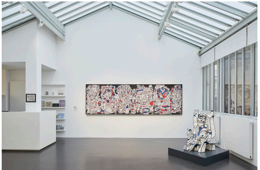
Solo exhibition Le Cours des choses, Jean Dubuffet, 2022, Jeanne Bucher Jaeger, Paris, Marais

This exhibition's starting point was Dubuffet's Hourloupe cycle, his longest and most monumental series, created over a period of 12 years, with which he began his relationship with the gallery. It starts with small, instinctive drawings executed by the artist in blue and red ballpoint pen while talking on the phone, as seen in a large number of drawings such as La Machine à écrire (1964), made in marker and ballpoint pen, which starts writing the history. These works are followed by Brouettes , Personnages , Arbres , Ciseaux , Escaliers , Logologies and Monuments , which explore the world's infinite variety via adventurous lines that enable human forms, figures or familiar objects to emerge through highly diverse techniques and materials, including marker, felt-tip pen, vinyl paint, collage and cutouts, that inspired the artist with their almost magical ability to embody distinctive forms. After the works in ballpoint pen on paper, the Hourloupe adventure took shape in paintings and sculptures that become monumental, leading up to such unimaginable architectures as the Closerie Falbala in the Paris outskirts, which houses the Cabinet Logologique , and costumes for the exhibition-performance Coucou Bazar .