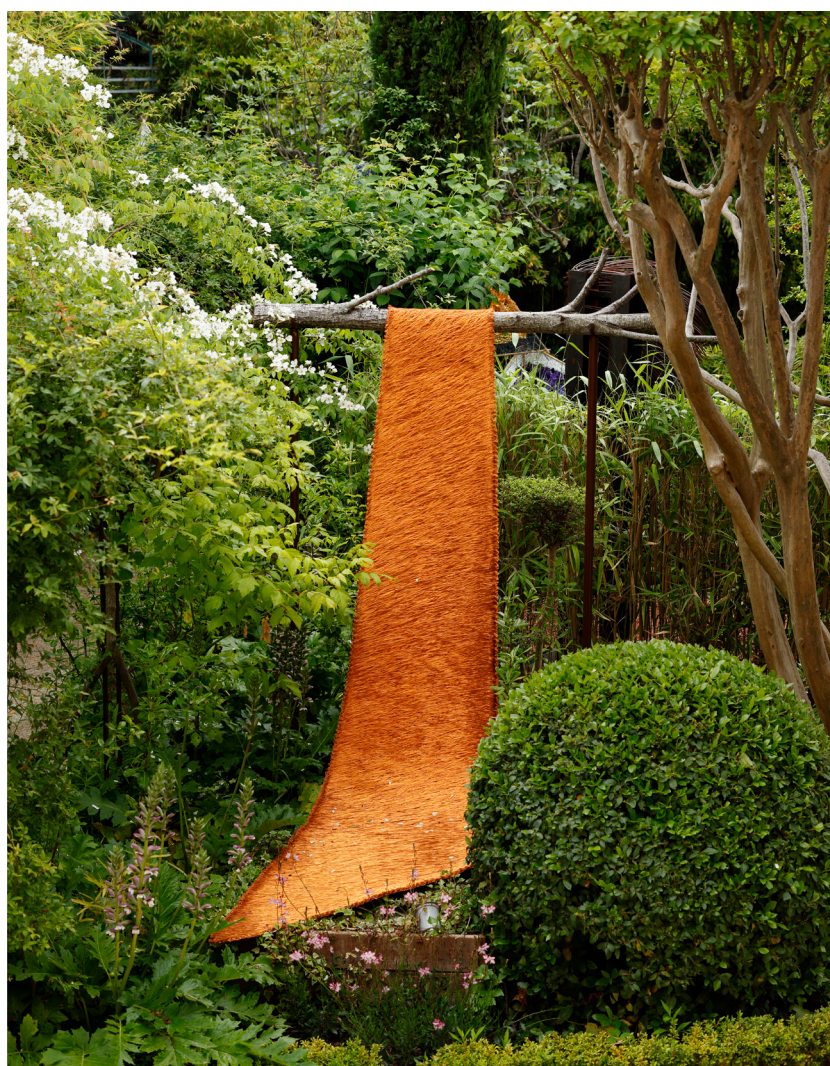
Exhibition TISSAGE TRESSAGE, 2018, Fondation Villa Datris, L'Isle-sur-la-Sorgue, France