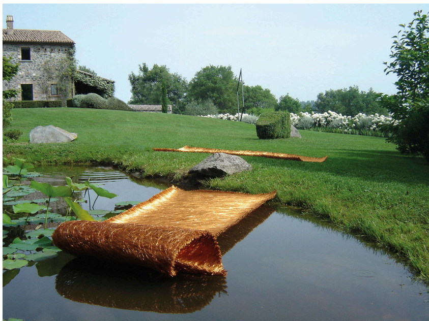
Antonella Zazzera's studio, Italy