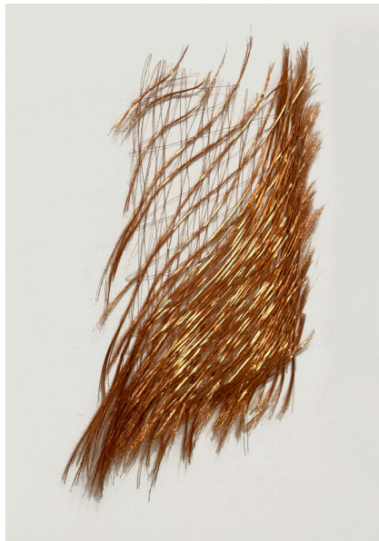
Armonico CDXV , 2023 copper wires, 87x25x13 cm © Jean-Louis Losi, Courtesy Jeanne Bucher Jaeger, Paris-Lisbon