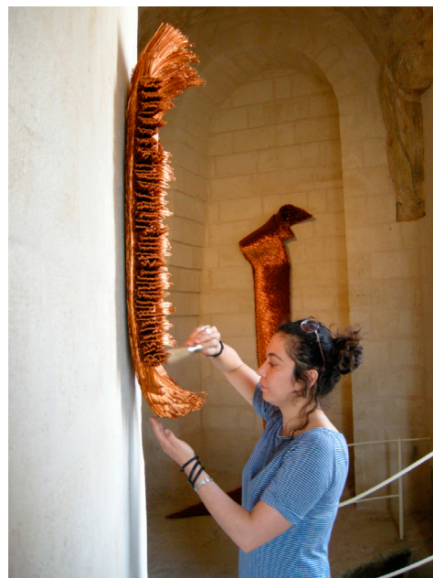
Antonella Zazzera © All rights reserved., Courtesy Jeanne Bucher Jaeger, Paris-Lisbon