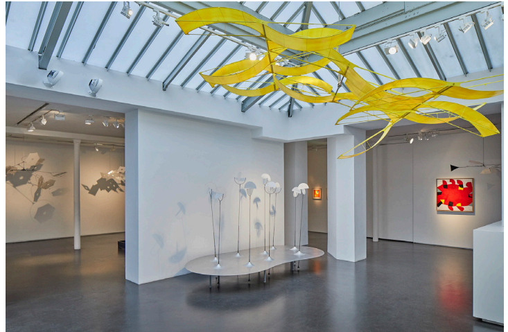
1. Starry Night , 2013, stainless steel, aluminum, carbon fiber, polyester, edition of 5, H114 x Ø160 cm 2. Exhibition, Susumu Shingu, Le Souffle d'ici - L'Eau de là [The Breath of Here - The Water Beyond] , Galerie Jeanne Bucher Jaeger, Paris, Marais, 2024

Susumu Shingu began his vocation as a painter in Japan and went to Rome in the early 1960s, fascinated by the art of the Renaissance, in particular by Piero della Francesca and Leonardo da Vinci, and by the multidisciplinary nature of the artists of the time, who were painters, sculptors, designers, architects, landscape architects, engineers, astronomers and scientists... His three-dimensionality was revealed to him by chance: the effect of the wind on one of his paintings, which he hung from a tree to photograph, set it in motion. This first contact with the invisible energies of Nature - the wind - later completed by that of water, sun, gravity... is fundamental. Susumu Shingu thus found, over time, not only his full vocabulary as a sculptor by working with the engineers to deepen the scientific aspect of his work, the intelligence of the detail of the shapes, the exact dimensions of the structural elements, the design of the seals, the anchoring points, the various means of fixing, the fundamental implementation of the ball bearings which allow rotations in perfect freedom, and by developing the practice of perpetual movement in his sculptures, whether they are subject to the infinitesimal interior air or to the most extreme winds outside; He also reconnects with his Japanese soul, marked by respect for absolute nature, acceptance of its unpredictability and contemplation of the beauty of its infinite forms.