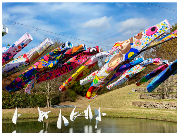
Susumu Shingu, Genki-nobori Workshop, September 2, 2023, Arimafuji Park, Sanda, Hyogo ©Susumu Shingu ©All rights reserved

Susumu Shingu's ability to translate the wind in all its forms, revealing it for decades in sculptures placed around the world, naturally led the artist, in perfect connivance with Leonardo da Vinci, to present his works in 2019 at the Domaine national de Chambord , in an exhibition entitled Susumu Shingu: une utopie d'aujourd'hui , conceived at the gallery's initiative in 2019, the year of commemorations celebrating both the 500th anniversary of the death of the Italian genius as well as the beginnings of the construction of the most emblematic castle of the French Renaissance. In the image of the Italian master's Citta ideale , the artist is previewing the model of his future village under construction, Atelier Earth, close to his Wind Museum in Japan, a village living from the natural energies of wind, water and sun, revealing and preserving the vital energy of the surrounding nature, a place where we can reflect on the future of the Earth, in connection with artists, musicians, writers, academics, philosophers, engineers, astronomers and scientists from all over the world , writes Shingu.