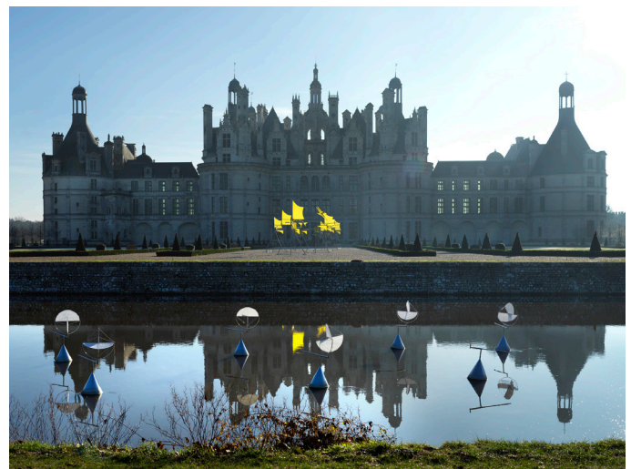
Solo exhibition Susumu Shingu, Une utopie d'aujourd'hui, 2019-2020, Domaine national de Chambord, France

A first exhibition at the gallery, Sculptures du respir was devoted to the artist in 2006, followed by Planet of Wind and Water in 2009 where the artist presented the diorama of his Breathing Earth project, a self-sufficient village living with the natural energies of wind, water and sun where each building is animated by his wind sculptures; a place of inspiration, exchange and action for artists, scientists and children instinctively in harmony with his philosophy of Nature. This project was the subject of a magnificent film Breathing Earth - Susumu Shingu's dream , shot over a period