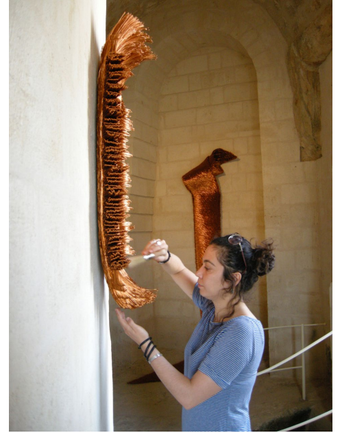
Antonella Zazzera