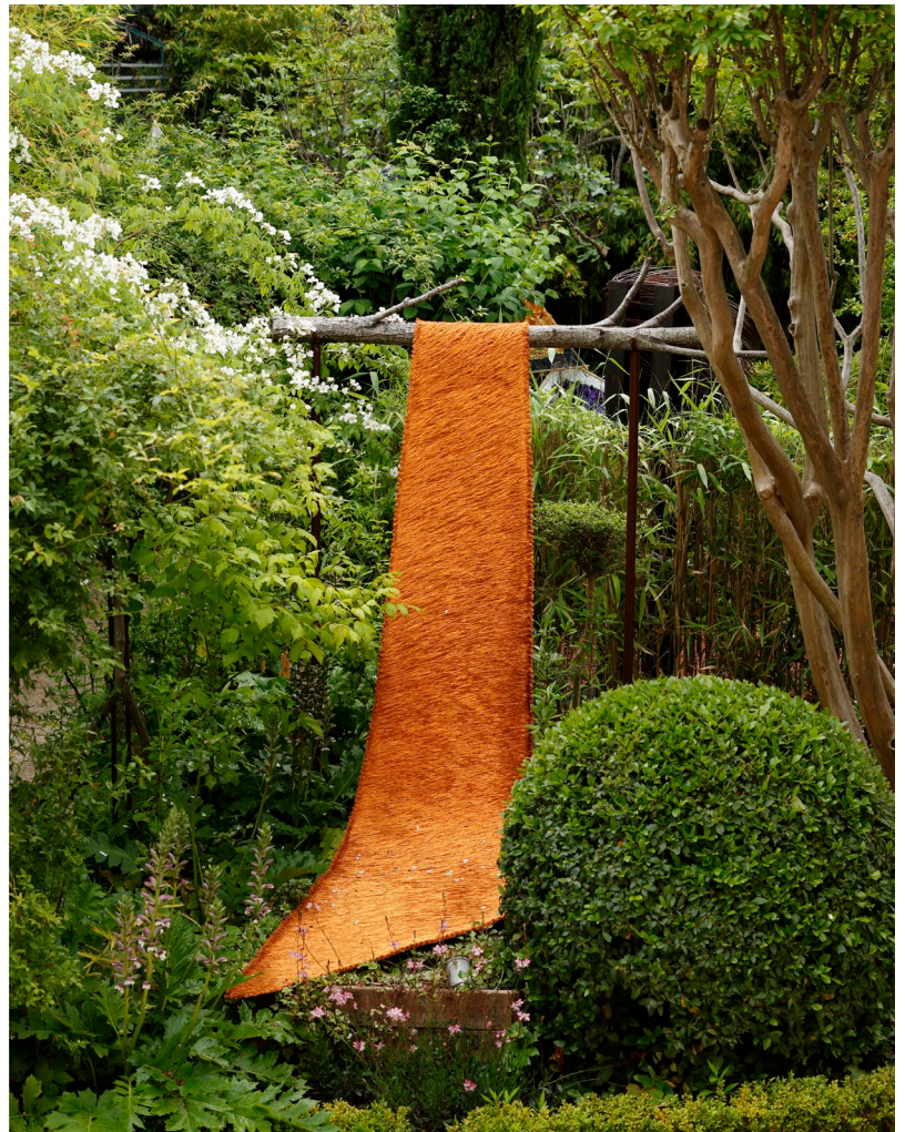
Exhibition view TISSAGE TRESSAGE , 2018, Fondation Villa Datriis, L'Isle-sur-la-Sorgue, France